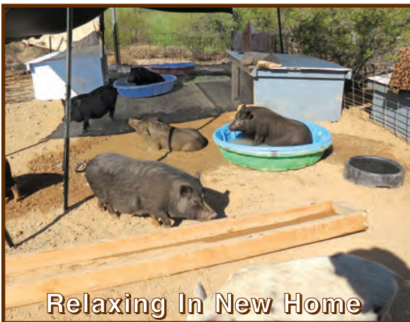
Relaxing In New Home

We'll never know the details of the horrors these pigs went through before coming to Ironwood and none of us really want to know that anyhow. The important part of their story is this: the pigs are now safe, well fed, watered, have shelter and the breeding has ended. We'll eventually get the girls spayed. Little Finnick will be neutered when age appropriate. The boys at the foster home are also protected, neutered and well taken care of. None of this would be possible without your help and support. I hope you know how much all of us at Ironwood appreciate you being there for the