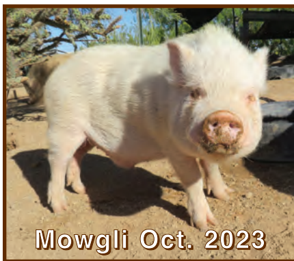
Mowgli Oct. 2023

the end they were able to recover and come home to us. Sadly, not all made it through that difficult time.