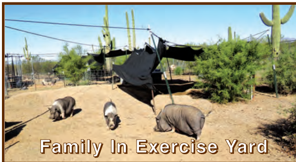
Family In Exercise Yard

A ccording to the Merriam-Webster Dictionary, sanctuary has multiple meanings. The ones that apply at Ironwood are: 1) a place of refuge and protection and 2) a refuge for wildlife where predators are controlled and hunting is illegal. While pot-bellied pigs are not considered wildlife in this country, they are protected from the local predators around Ironwood. Coyotes live out here in the desert and are often seen trotting across the road or