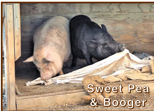
Sweet Pea & Booger

Each of the holding pens is well shaded with a shelter, wading pool, and mud wallow. Families are kept together whenever possible. If they arrive unaltered, males and females will have to be kept separate until the boys have been neutered and gone through the 45 days that testosterone can still be present in their systems. Some of the pens are larger with more housing for families or small groups that have been formed. Friendship is an