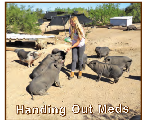
Handing Out Meds

pigs and make determinations as to treatments needed. Then there are the regular things like dental exams, ear cleanings, and hoof trims that are done periodically. It's all part of taking care of the individual pigs.