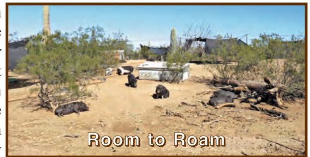
Room to Roam

When a pig comes to us, it first lives in an individual holding pen with limited daily access to an