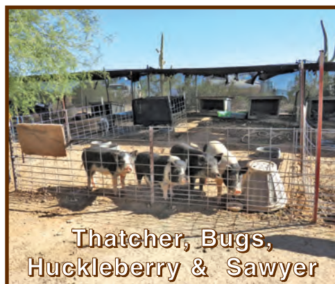
Thatcher, Bugs, Huckleberry & Sawyer

also means safety from humans who sadly are the major cause for the pain and suffering of so many pigs. The stories we could tell you of things we have seen at the homes of some of these pigs would make you want to lock