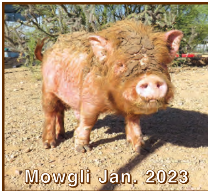
Mowgli Jan. 2023