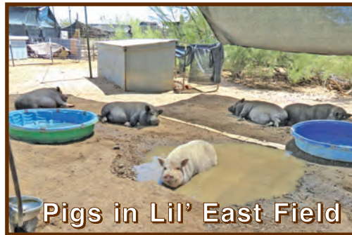
Pigs in Lil' East Field

Later the “pen pigs” will join a herd in one of the 25+ fields where the pigs are divided according to their ages, personalities, emotional status and physical abilities. Here they will have plenty of space to roam with the freedom to do as they please. Each field has plenty of shelters of various sizes so that the pigs always have choices of where they want to sleep, whether alone or with friends. The houses