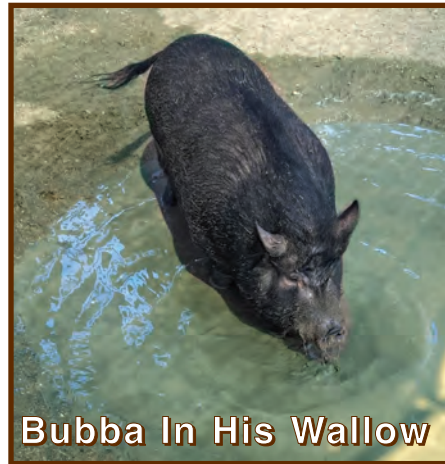
Bubba In His Wallow

However, he has missed his family and was quite depressed and frightened for some time. But he is adjusting now after one of our staff who regularly feeds him has taken a lot of time and patience with him to make him feel loved and welcome here.