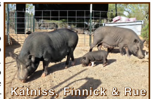
Katniss, Finnick & Rue

been taken to the vet clinic right away. The poor girl was okay, just suffering from malnutrition. After Finnick was a bit older, we put Aloysia in with Rue and the gang. They are getting along very well and she was happy to be amongst the other pigs. Finnick loves living with his mom and all his "aunties!"