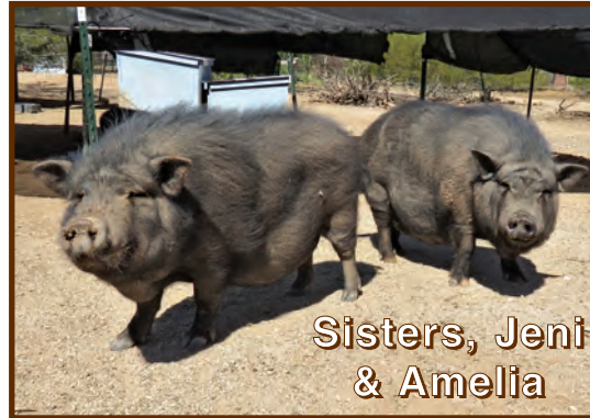
Sisters, Jeni & Amelia

stopping to grab a drink at the edge of the property where the water well continuously drips into a large bowl for the wildlife. Those of us that live onsite at Ironwood are often serenaded by coyotes in the early morning hours. But none have ever penetrated the sanctuary's boundaries. The outer perimeter of the pigs' living areas is six-foot chain-link fencing with poles along the bottom to discourage digging under. As far as the hunting part of that definition, to our shock we actually did get a phone call once with someone asking about pricing for a day's hunt and what the bag limit was.