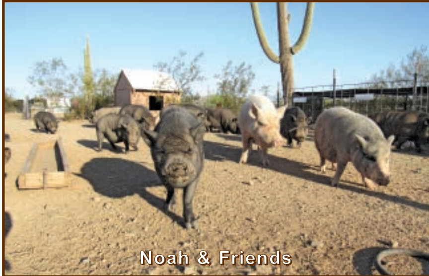
Noah & Friends

N oah is one of the "Peoria Pigs," a large group of pigs rescued from an abuse/neglect case in Peoria, AZ that were featured in the Ironwood Update of October 2015. He has lived with us for 8½ years and is around 9½ years old.