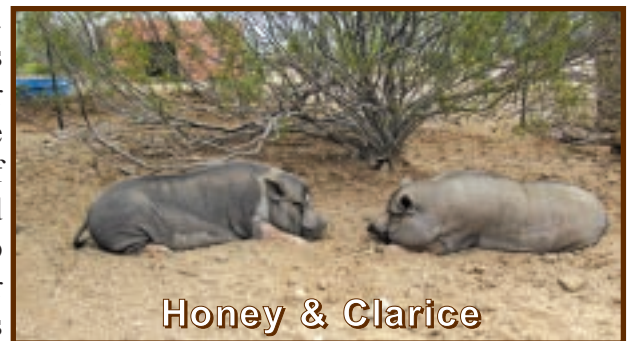
Honey & Clarice

During the past year four of the St. Matilda's pigs have moved to special care places due to declining health. Princess lives in one of our hospice homes called the Cat Shelter. Larry, Sean and Benny live next door to her in Camelot, another of the special care areas built for seniors that have developed physical difficulties.