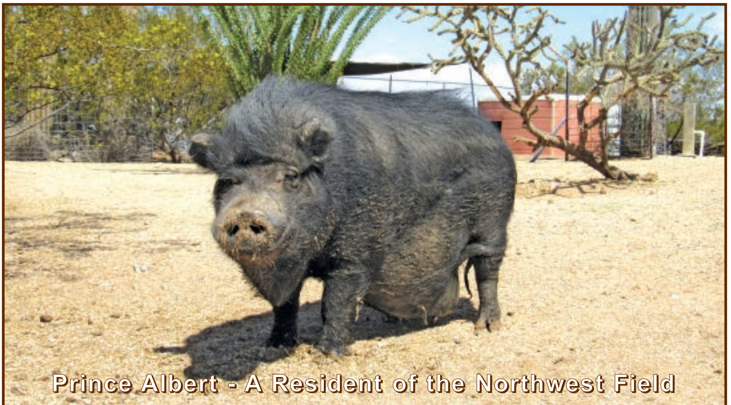
Prince Albert - A Resident of the Northwest Field