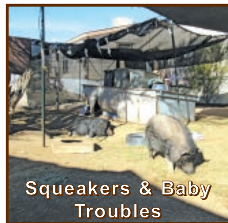
Squeakers & Baby Troubles

Ganesha were old friends in the Princess Field and were later happily reunited here in the yard. This yard is a little larger and can easily house 8 or 9 pigs especially since they don't require a lot of space in their condition.