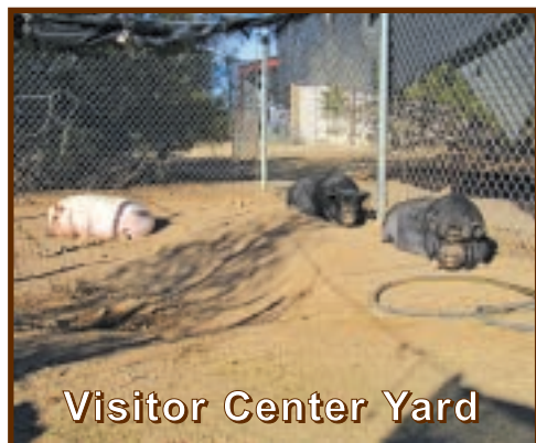
Visitor Center Yard

T he Ironwood Pig Sanctuary will be celebrating its 15th anniversary later this spring. When we first began taking in pigs we provided large fields with lots of room for the pigs to roam. As years passed by the needs of those pigs began to change as they aged. Many became arthritic and unable to cope in such big spaces. Getting from one area of the field to another became a challenge. Dealing with the younger, stronger pigs that were arriving was too difficult. We realized that our senior pigs needed a smaller safer environment in which to spend their golden years.