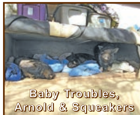
Baby Troubles, Arnold & Squeakers

needing special care. Arnold is currently sharing his shelter with Squeakers and Baby Troubles. He has made good friends with several pigs that have come to live in the backyard but are now no longer with us. Arnold always opens his heart and his home to those who come to fill those empty places. Lily, Pegasus and