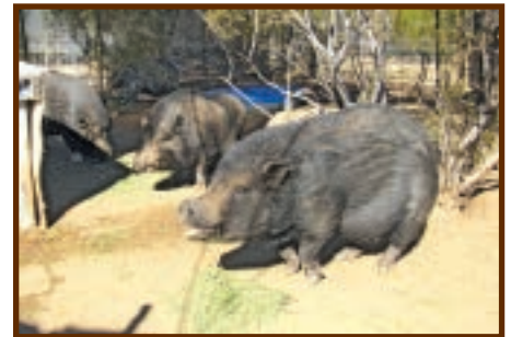
Ellie Mae & Pals

is necessary....that can't be ignored. Special foods, more medication, watching that the mud wallows don't get too deep for the arthritic pigs to get out of,