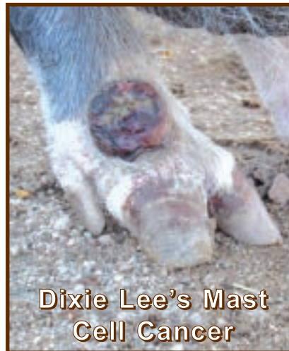
Dixie Lee's Mast Cell Cancer

there are issues they can get infected teeth or pockets in their mouths. We do monitor the way our pigs eat and take them in for dentals as we notice any difficulty for them. They often get teeth pulled which sometimes ends up