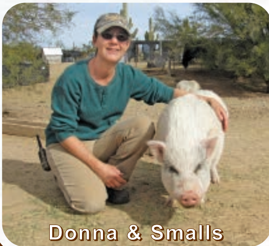
Donna & Smalls

Five of the pigs shown here had sponsors for several years but all lost theirs for various reasons this past winter. Please help them as well as our newer arrivals find new "parents". In exchange