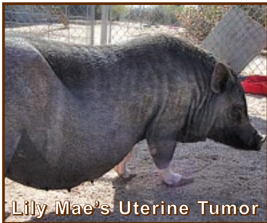
Lily Mae's Uterine Tumor

As they age pigs will tend to get arthritis. Some get it younger than others and some won't show