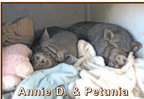
Annie D. & Petunia

Our first step towards accommodating the elderly pigs was fencing in a backyard at the Visitor Center which in the early years was used as living space for an onsite staff member. The yard has been used as a home for several pigs over the years but with a 5 pig maximum. At this time Petunia, Annie D., Leota and Squeaky call this yard home. Petunia was moved there because her blindness and the defensive